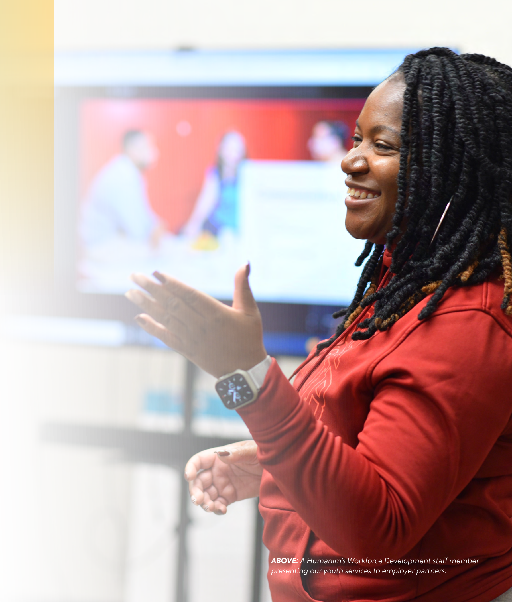
ABOVE: A Humanim's Workforce Development staff member presenting our youth services to employer partners.