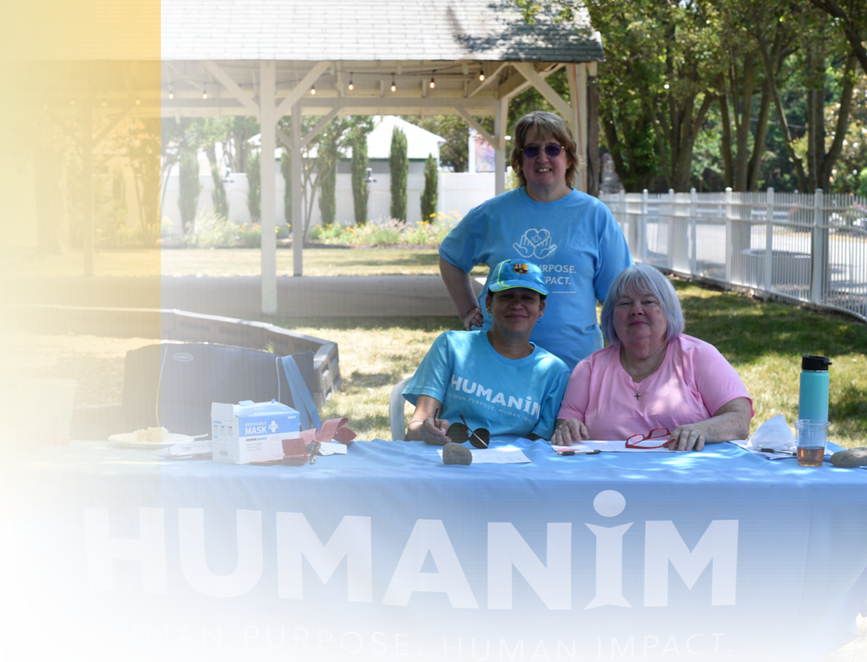
ABOVE: Humanim team members at the annual Do-Bester's Fest.