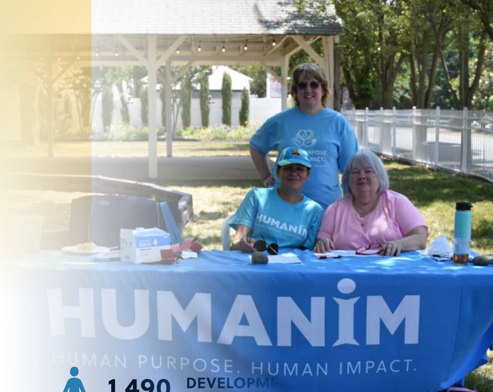
ABOVE: Humanim team members at the annual Do-Bester's Fest.