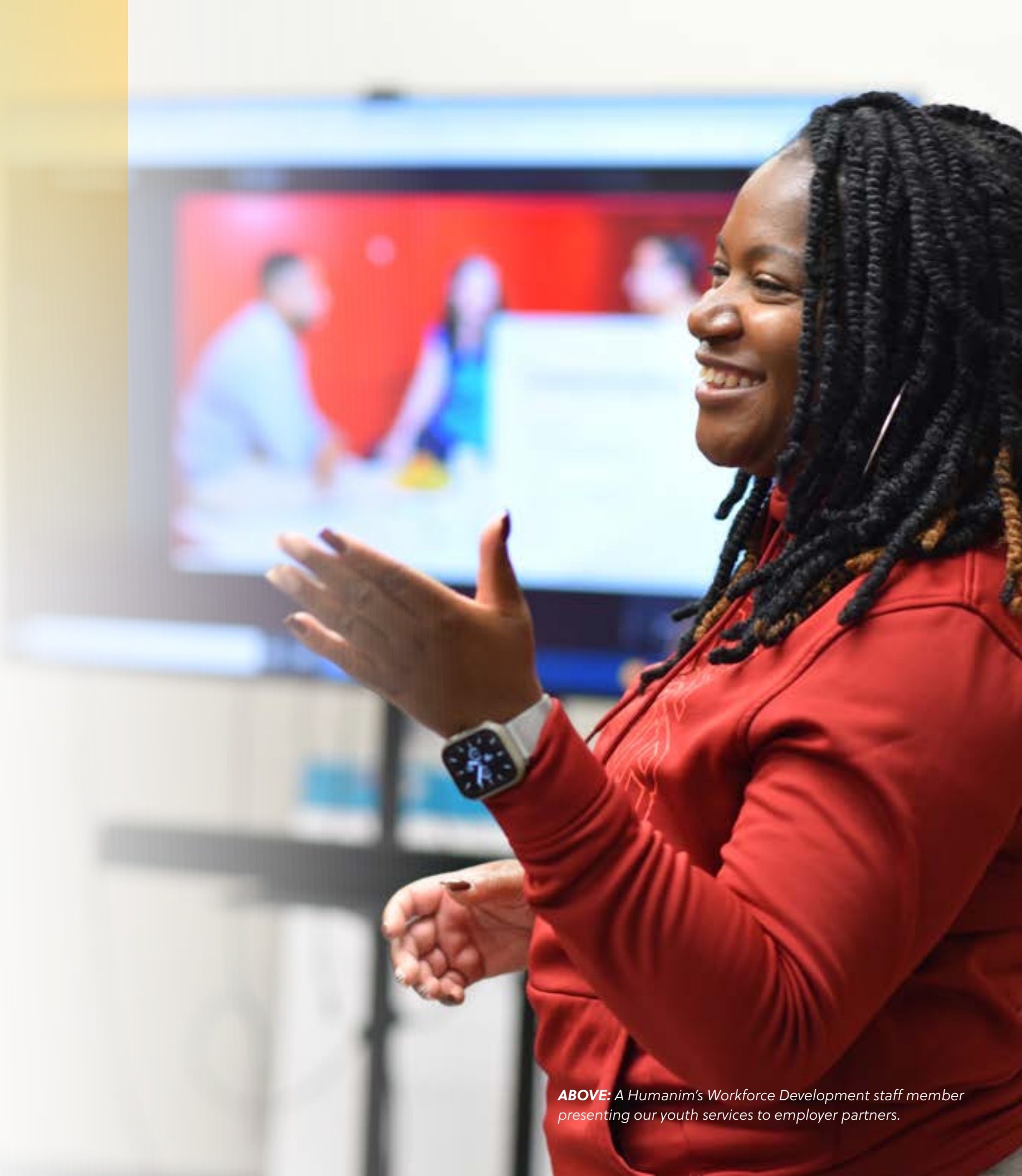
ABOVE: A Humanim's Workforce Development staff member presenting our youth services to employer partners.